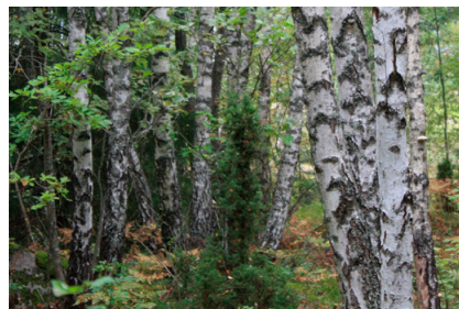
Birch genome is mapped.