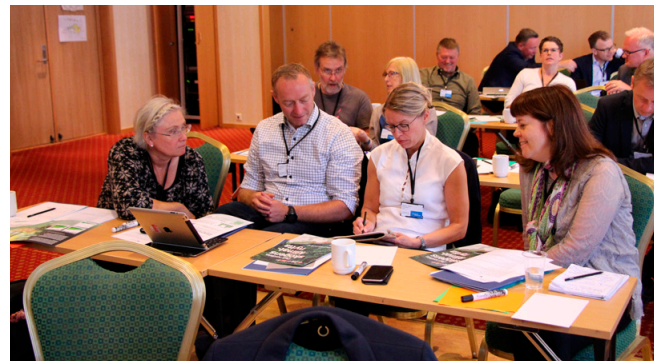
Intensive discussions about climate and biodiversity at the seminar.