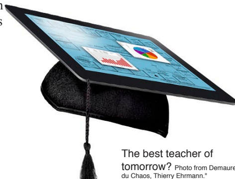
The best teacher of tomorrow? "

All these trends will put a pressure on the universities, who will see a reduced interest in traditional class lectures. A popular teacher of tomorrow will be one who acts and inspires on a web-based platform, reaching thousands of students.