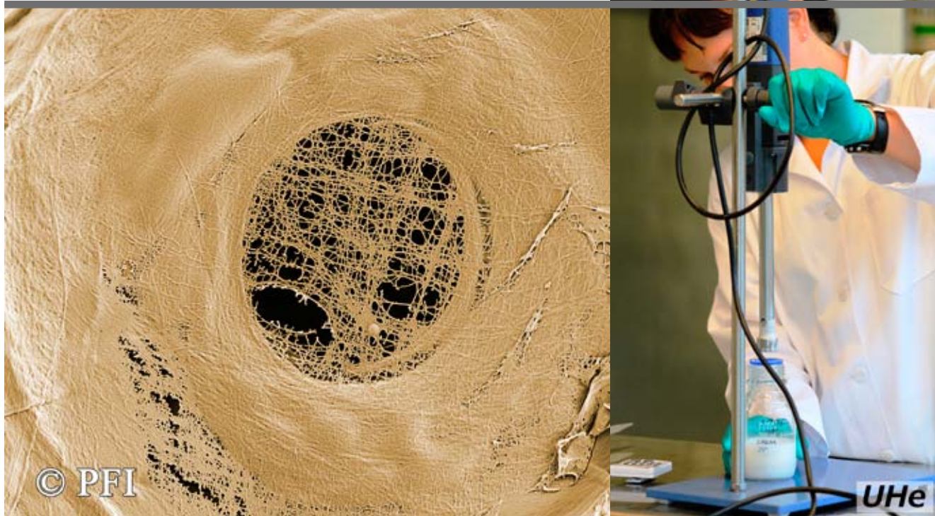
A magnified wood fibre from spruce, showing the cellulose nanofibrils and also a pore, covered by the fibrils (left), and emulsion preparation (right).