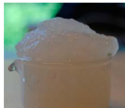
Nanocellulose hydrogel.